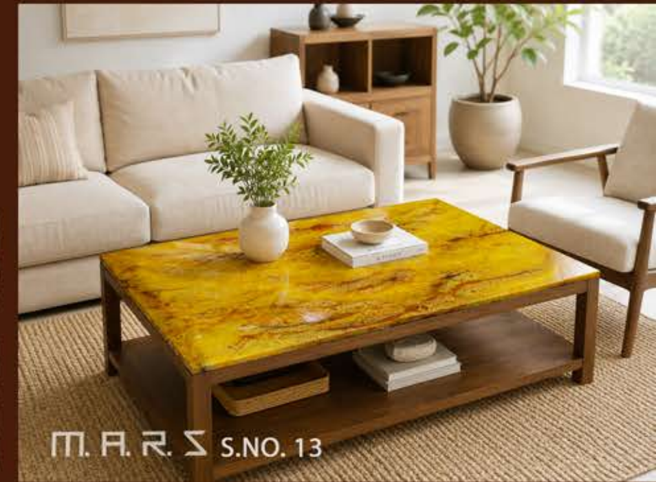
M. F. R. Σ S.NO. 13