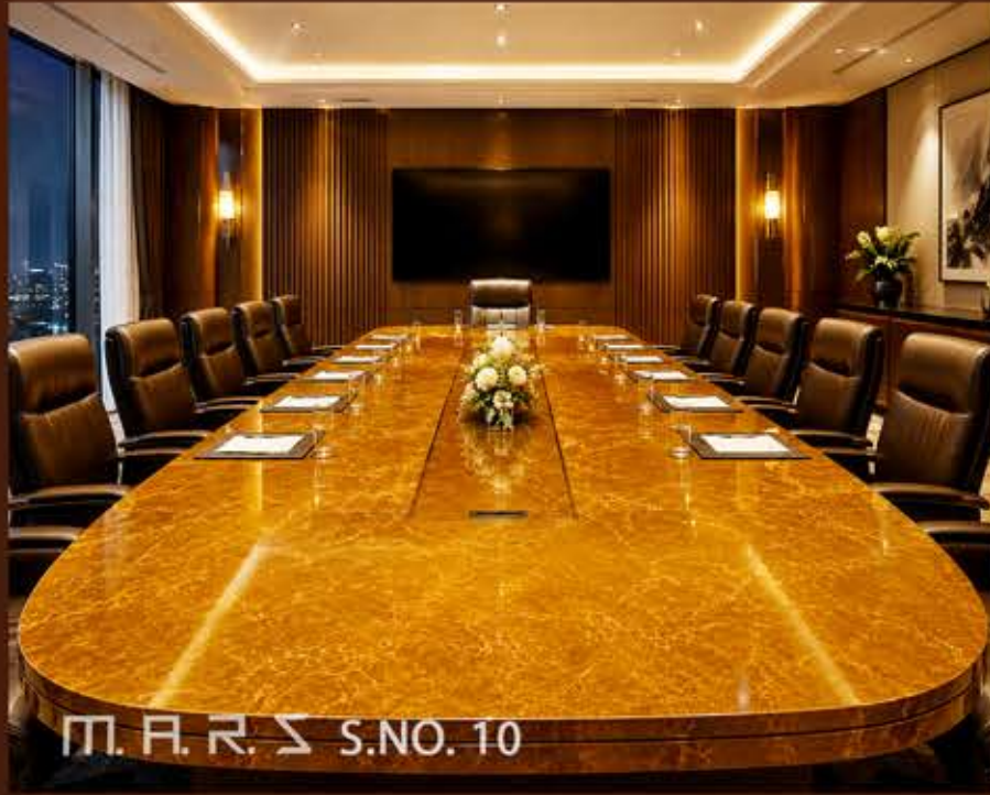
M. F. R. Σ S.NO. 10