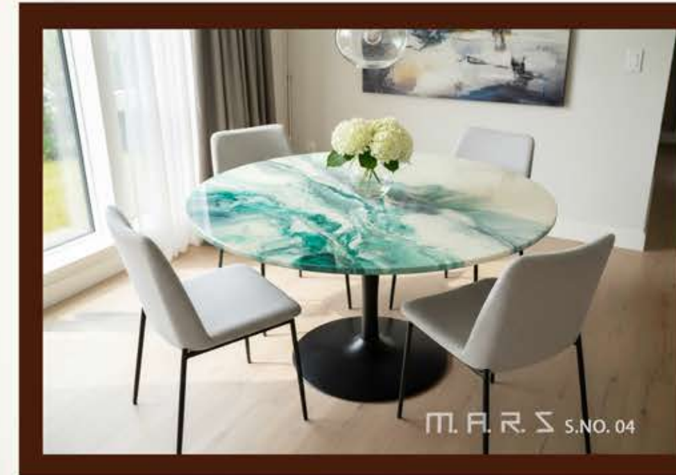
M.A.R.S S.NO. 04