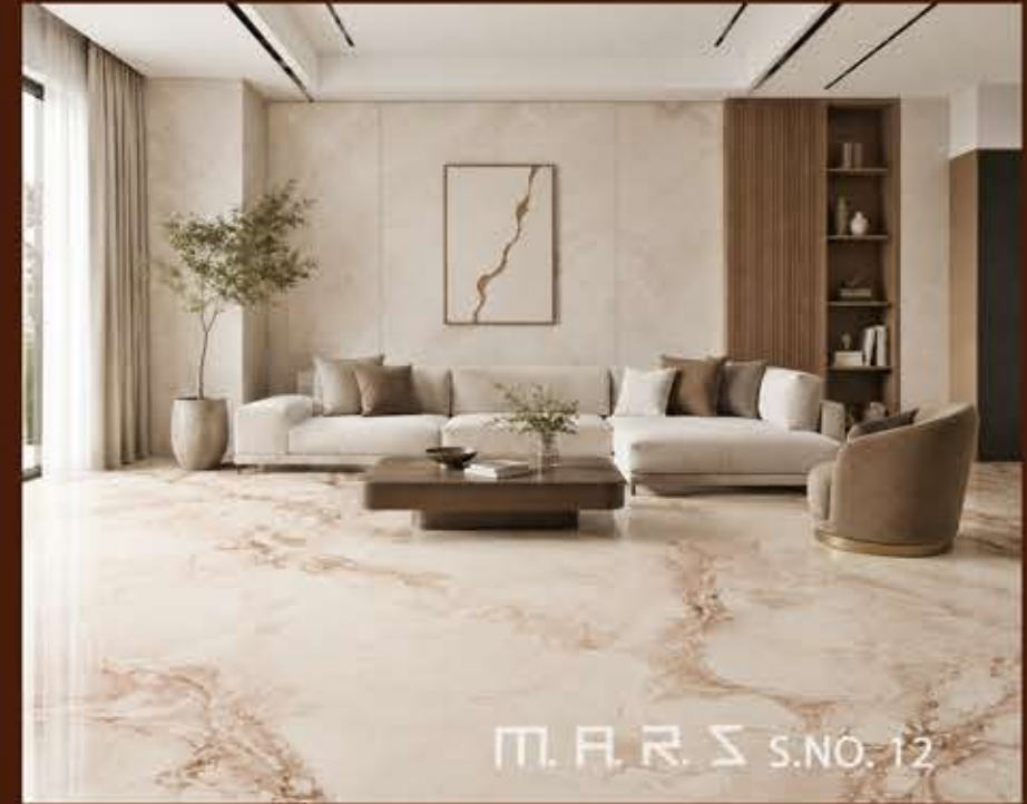
M. F. R. Σ S.NO. 12