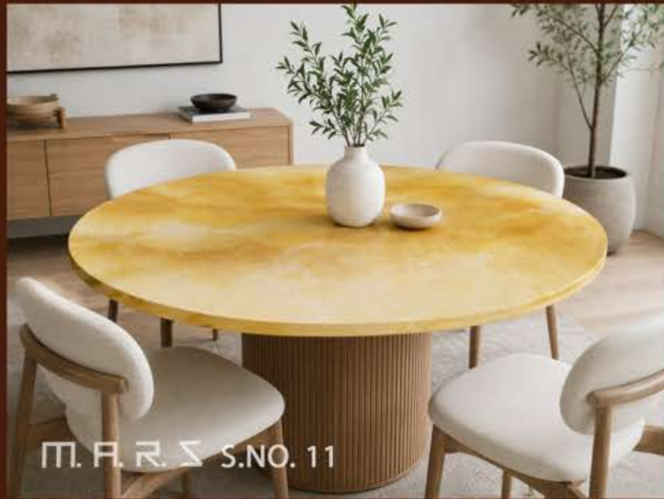
M. F. R. Σ S.NO. 11