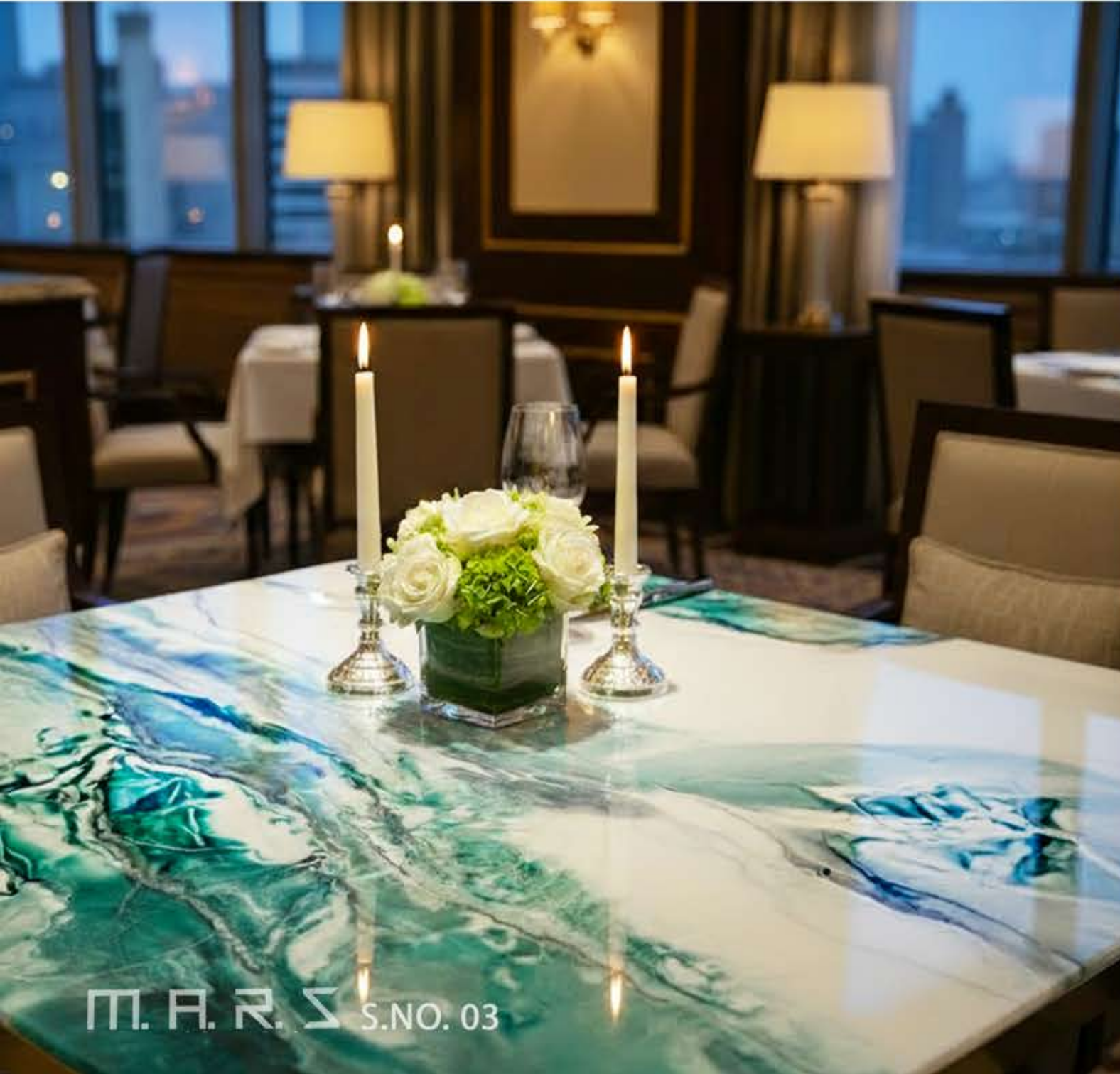
M.A.R.S S.NO. 03