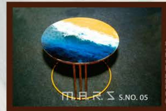
M.A.R.S S.NO. 05